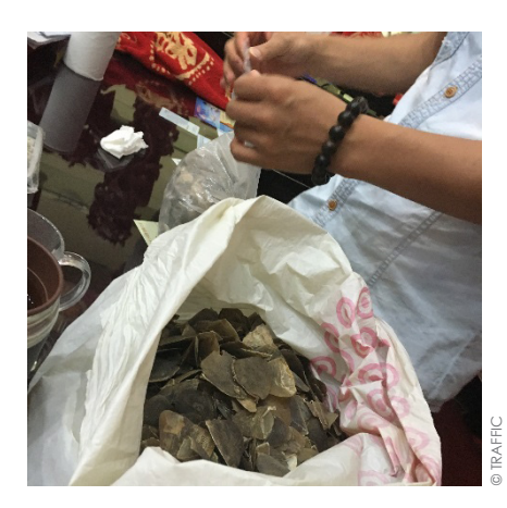
Raw pangolin scales for sale in TCM wholesale market

When asked about the source of the scales, most traders refused to answer or answered evasively, clearly illustrating their knowledge of the laws and the illegality of the trade. Only 34% of animal medicine wholesalers with scales for sale were willing to reveal their source—pangolin scales sourced from overseas were mainly claimed to be from Southeast Asian countries, including Myanmar and Viet Nam, as well as African countries. Scales from domestic sources were mainly from Guangxi and Yunnan provinces (which border Viet Nam and Myanmar respectively). However, according to traders in Guangxi, Viet Nam was merely a transit country for pangolin scales, and a lot of scales were in fact sourced from Pakistan. 18% of TCM retail shops with scales for sale revealed that scales were bought from pharmaceutical companies, except for one shop that sourced them from Viet Nam. Since pangolin scales are only allowed to be sold in designated TCM hospitals and to be manufactured into patented medicine by