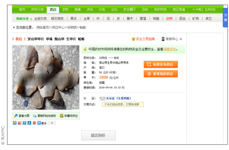
Raw pangolin scales for sale on a TCM website

Nam (26%), African countries (16%: two advertisements named the sources as Nigeria and Equatorial Guinea), Thailand (10%) as well as Myanmar and Indonesia. Within China, scales were mainly sourced from Guangxi and Yunnan provinces (55% in total), followed by Shaanxi, Guangdong, Guizhou and Hebei provinces. The average price on Website B was USD427±150/kg (n=56), which is lower than prices at physical TCM wholesale markets (by USD74-107/kg), and less than half that of prices in TCM retail shops. When entering "pangolin" into the search box on the website, researchers found various advertisements for pangolin