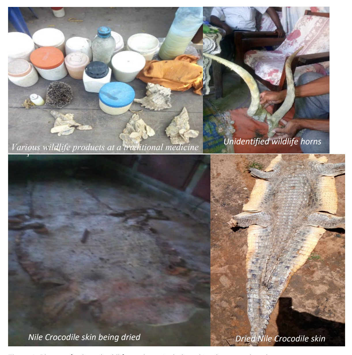
Figure 3. Photos of selected wildlife products, including skins, horns, and teeth.