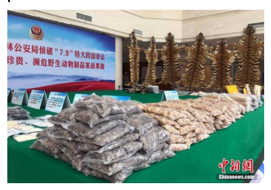
Guangxi, 26 Dec 2018 ——Since July 2018, Guangxi has successively cracked four cases of illegally acquiring, transporting and selling

precious and endangered wild animal products. 24 suspects (including 1 Vietnamese) were arrested and seized 11 pieces of tiger skin and 1595 snake, 81.49 kilograms pangolin scales, and etc. The total value of the cases involved is 29.715 million yuan. Read More