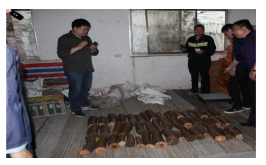
Nanyang, Henan, 29 Dec 2018——Nanyang