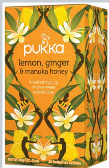
Lemon, Ginger & Manuka Honey herbal tea with FairWild ingredients