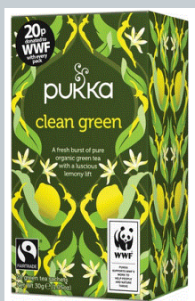
Clean green herbal tea with FairWild ingredients